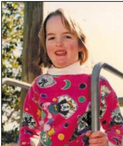
This is me at pre-school before my treatment began at PMH.

The not so noticeable characteristics include early childhood development delays, slow motor skills and behavioural problems. I