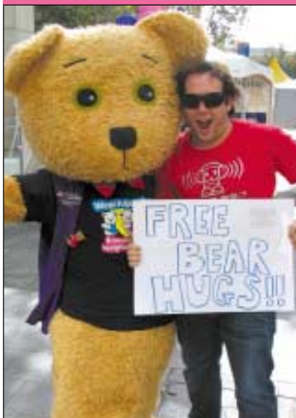
Stitches gives out free bear hugs on Wear A Bear Day.

Thousands of pink and blue Stitches bears hit the streets of Perth in May for PMH Foundation's annual community appeal Wear a Bear Day, which raised in excess of $80,000 and counting.