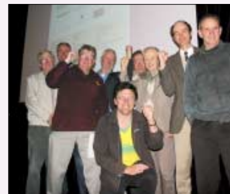
The happy team of Rising Fast who finished on top of the leader board.

Quiz lovers, the general public and corporate teams all took part. However, the winners on the night were Rising Fast , a team that included retired school teachers and an ex-Australian Bureau of Statistics employee - all good training for the curly questions put to them throughout the night!