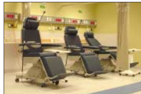
The new ward, including the same-day care unit pictured here, is fitted with the latest technology.